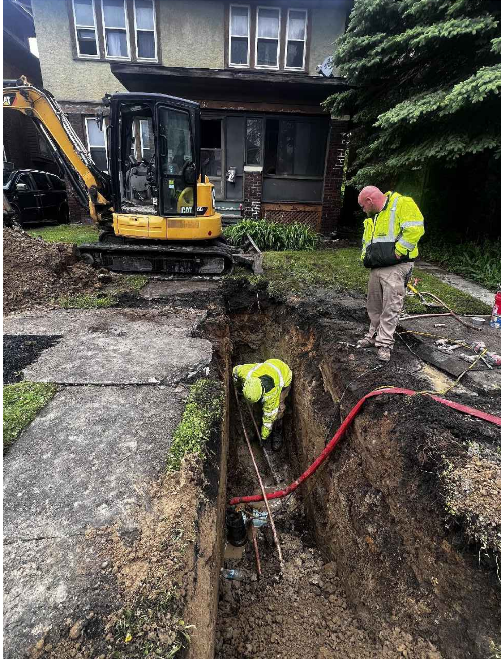
COPPER SERVICE LINE INSTALLATION