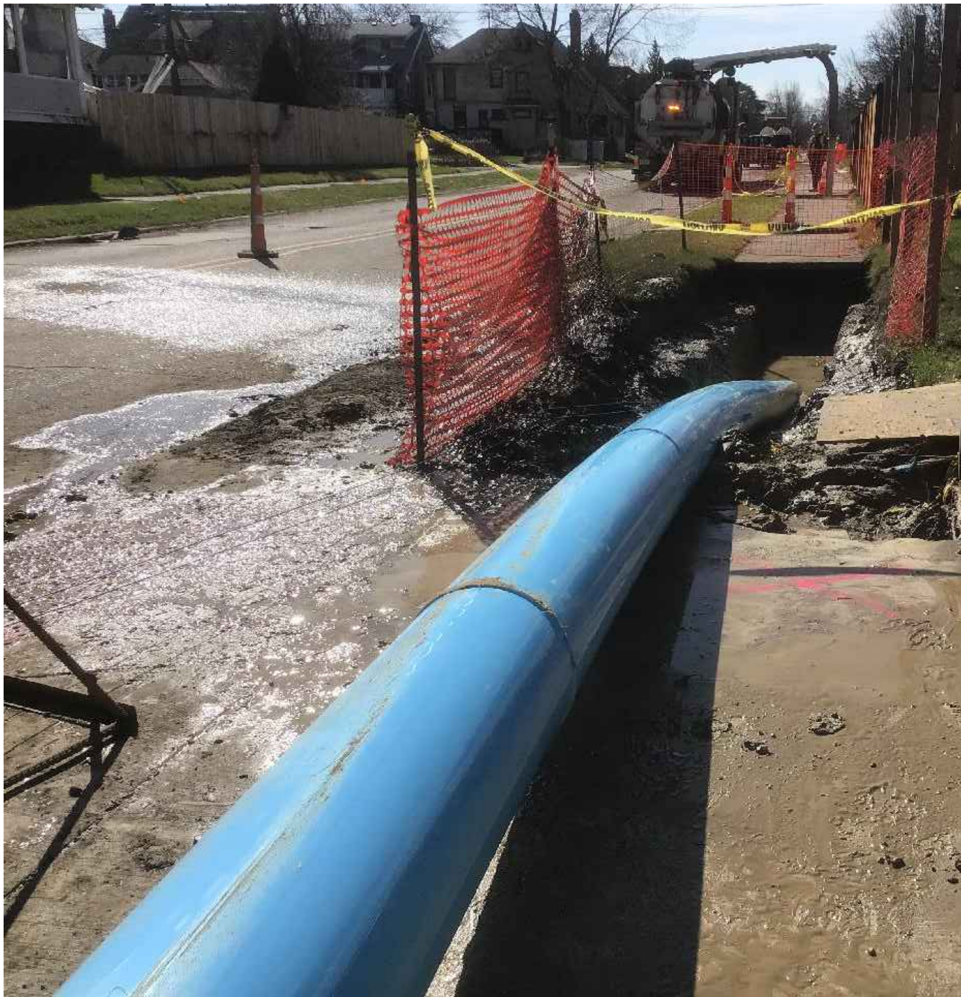
12" WATER MAIN INSTALLATION: HORIZONTAL DIRECTIONAL DRILL